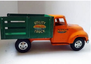
1980 tonka dump truck value. 1980 tonka trucks value. 1980 tonka truck.